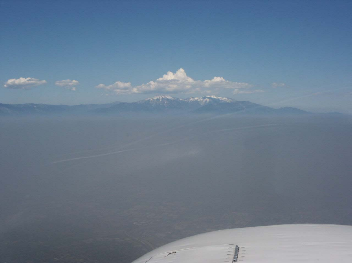
That's Big Bear up there and filth down there.

The clouds were gone but the air was dirty. After just a few miles, I was high enough to be above the smog, and it was thick. Once above though, it was clear.