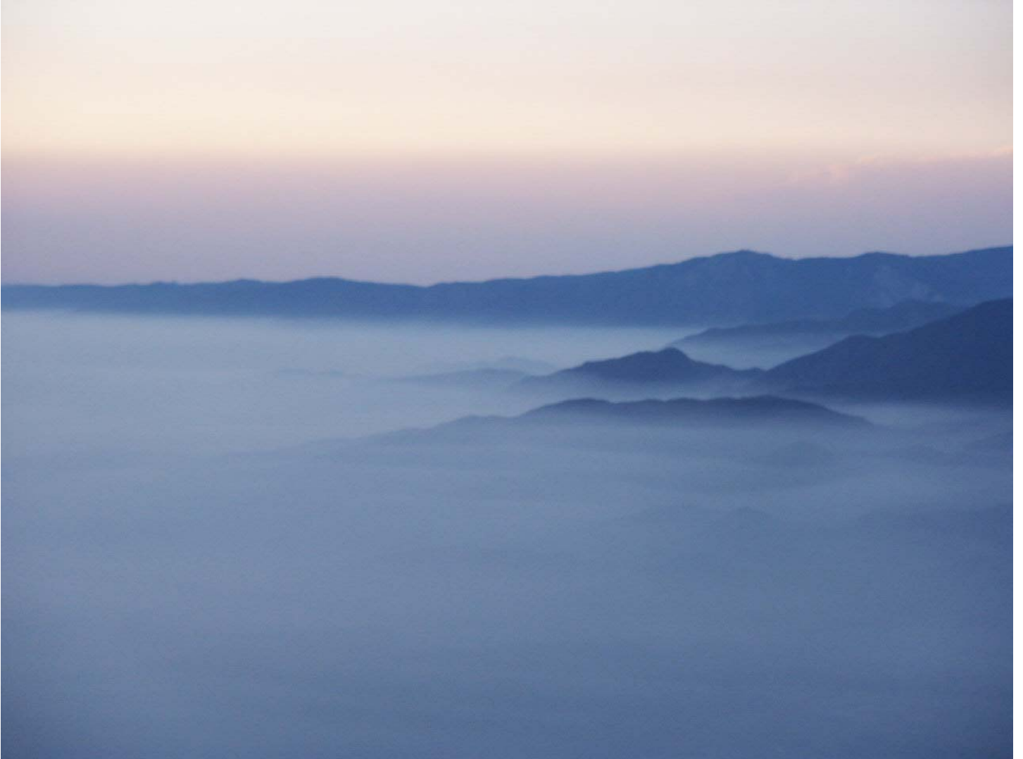
The Rialto, Upland, Ontario, Colton, El Monte area.

Looking to the northwest, miles and miles of the same