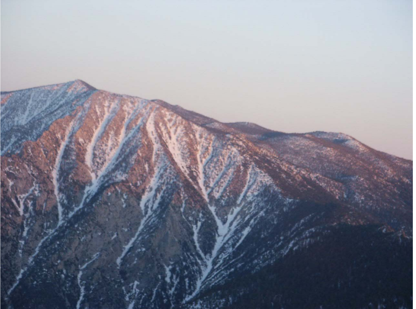
San Jacinto Peak

On the way back, just before sunset, I snapped San Jacinto Peak by Palm Springs. The red tint is from the low sun angle.