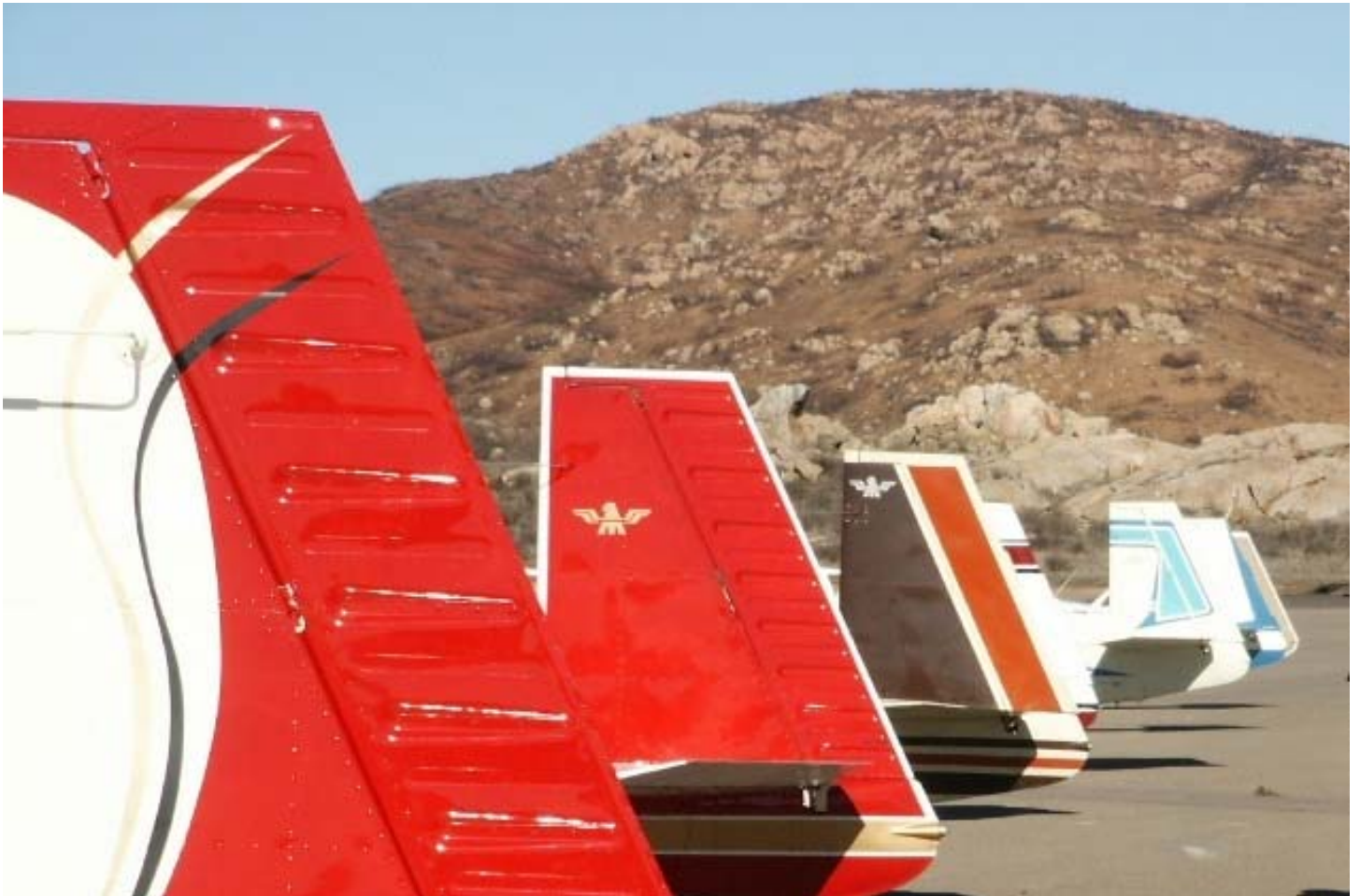
Those beautiful Mooney tail feathers