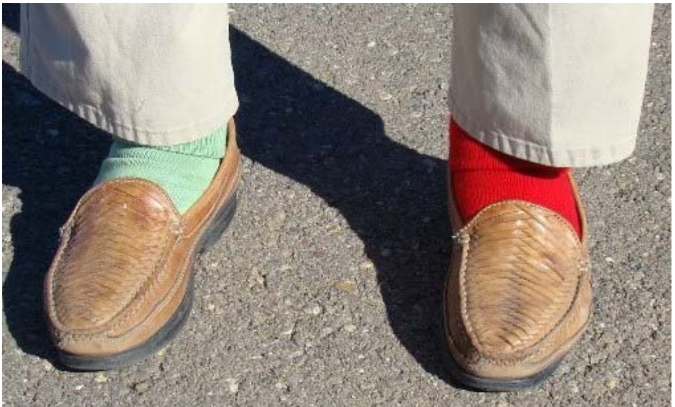
Christmas colors - or – Starboard and Port