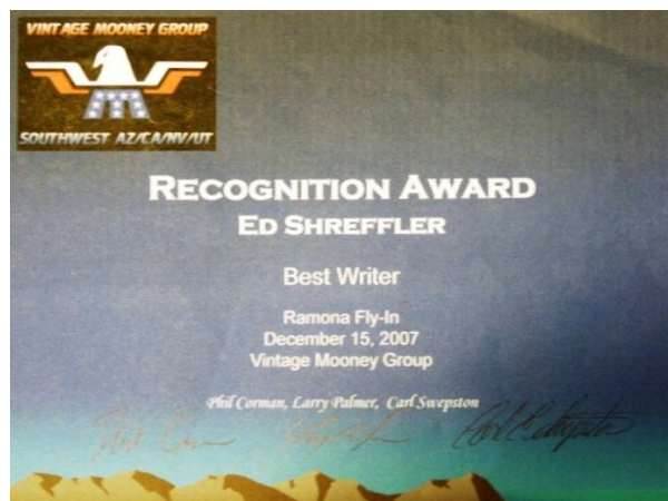
The board presented yours truly an award after lunch