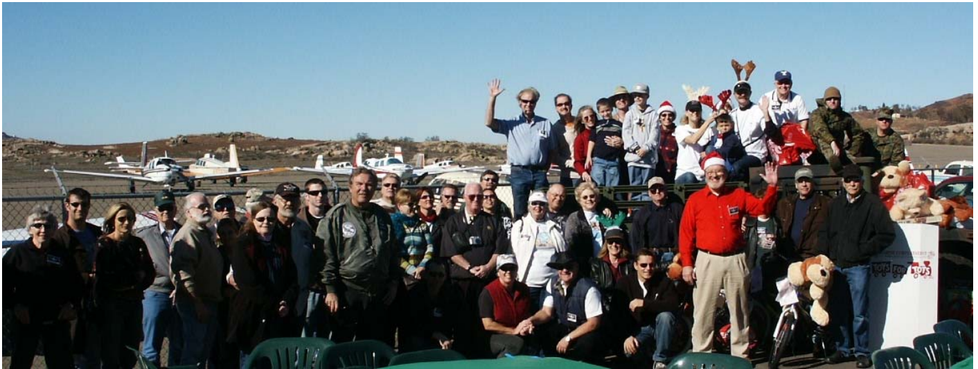
The VMG group – the toys – the Marines and their truck.