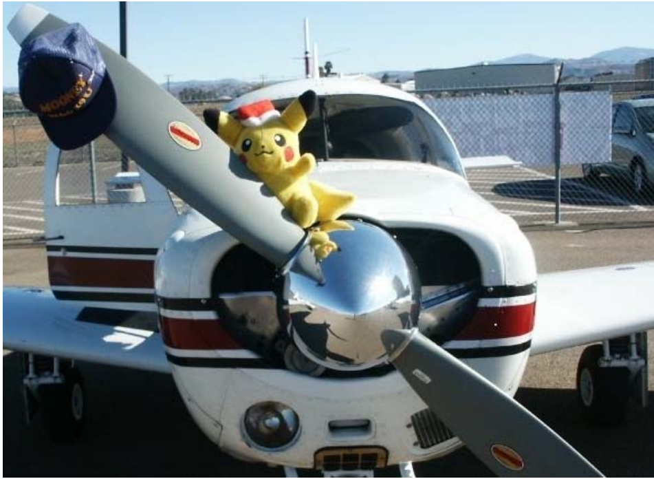
Should have gotten the Cutest Mooney award